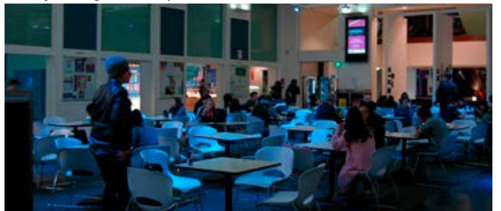
Union House emptying as semester comes to a close.