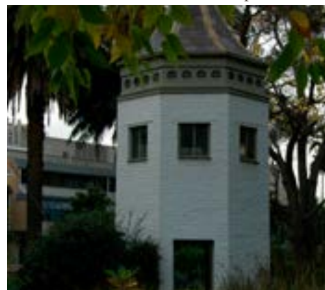
System Garden, still beautiful, even in autumn.