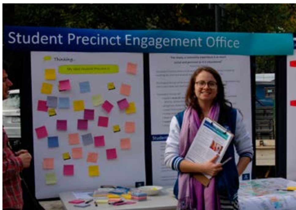
This week, the Student Precinct Engagement popup will be at Union House (Tues), the Spot (Weds).