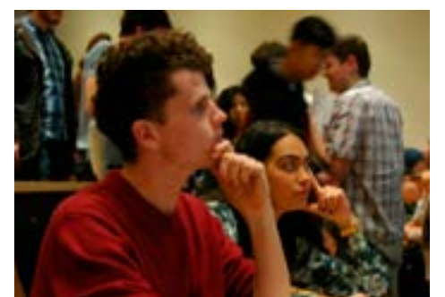
Clubs & Societies Council.