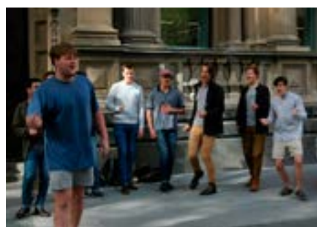
Trinity Tiger Tones at it on Wednesday.