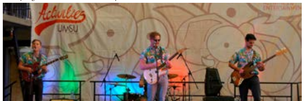
Pockets performing as the Tuesday band.