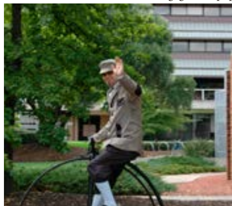
Tweed ride. (Parkville Station declined an attempt.)