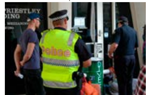
Police officers encouraging FFMU protesters to move away from the doorway.