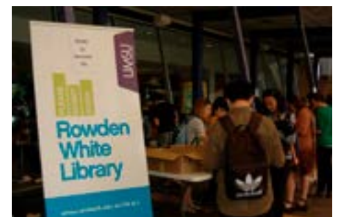
Rowden White Library book sale, North Court.