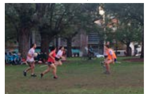
The Melbourne Unicorns practise Muggle Quidditch on University Square.