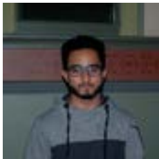
Mohammad Bin Qasim