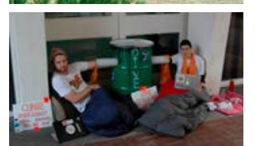
More divestment activism from Fossil Free Melbourne University.